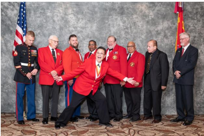
Lehigh Valley Detachment 296