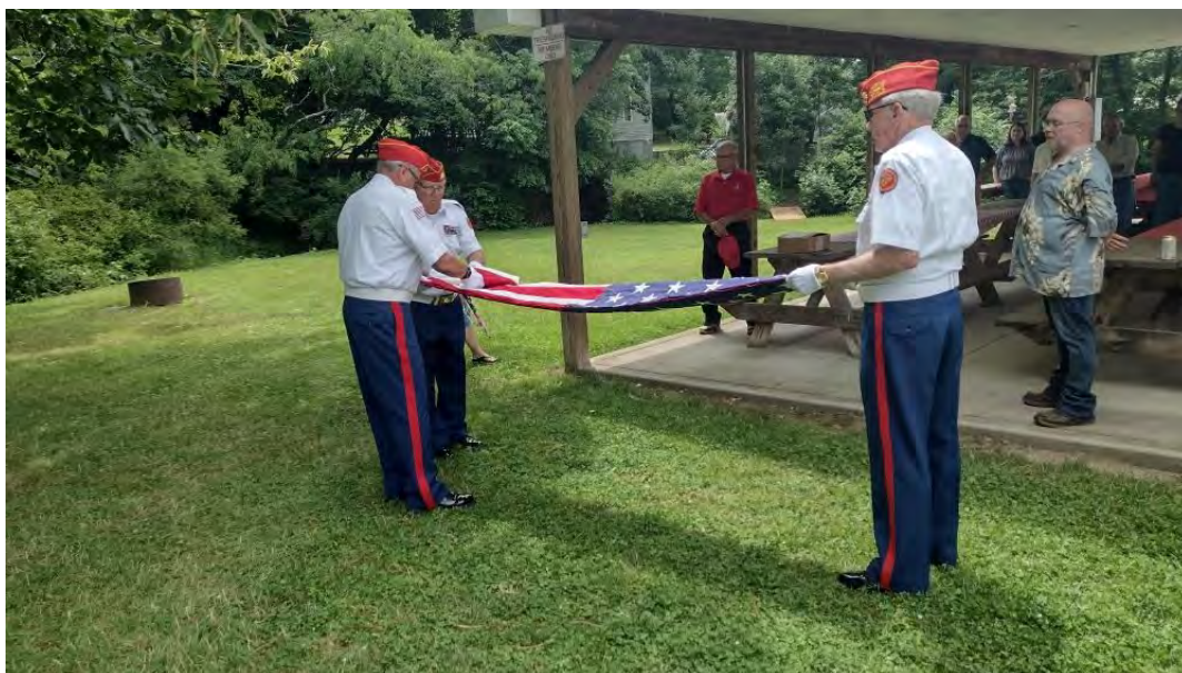
Bantam Marines Detachment #743