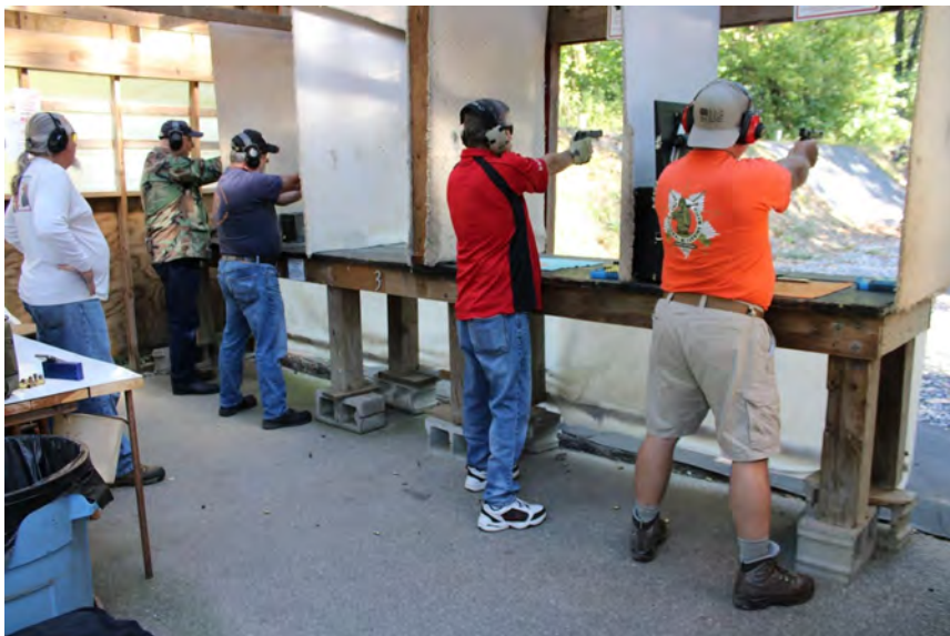
First Capitol Detachment #521, Marine Corps League, York Pa.

Marine Corps League 287 Johnstown, PA held their first MCL Pistol Match on June 24th at Daisytown Sportsman Club! Six shooters competed from Conemaugh Valley Det, Three Rivers Det, and Ohio Valley Det. They competed for the Dept of PA Annual Pistol Match.