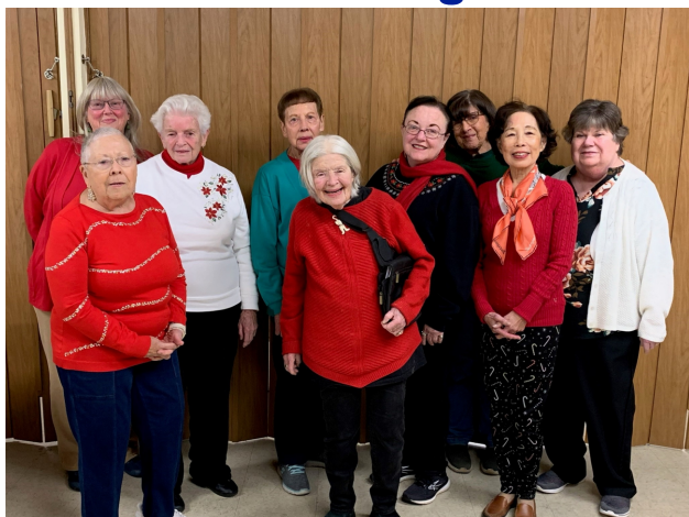
Everyone was very festive at our December meeting.