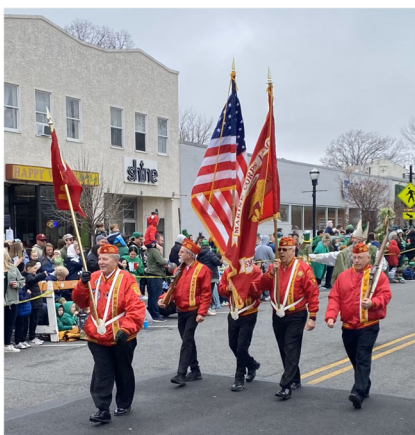
Color Guard, Springfield St. Patrick's Day Parade