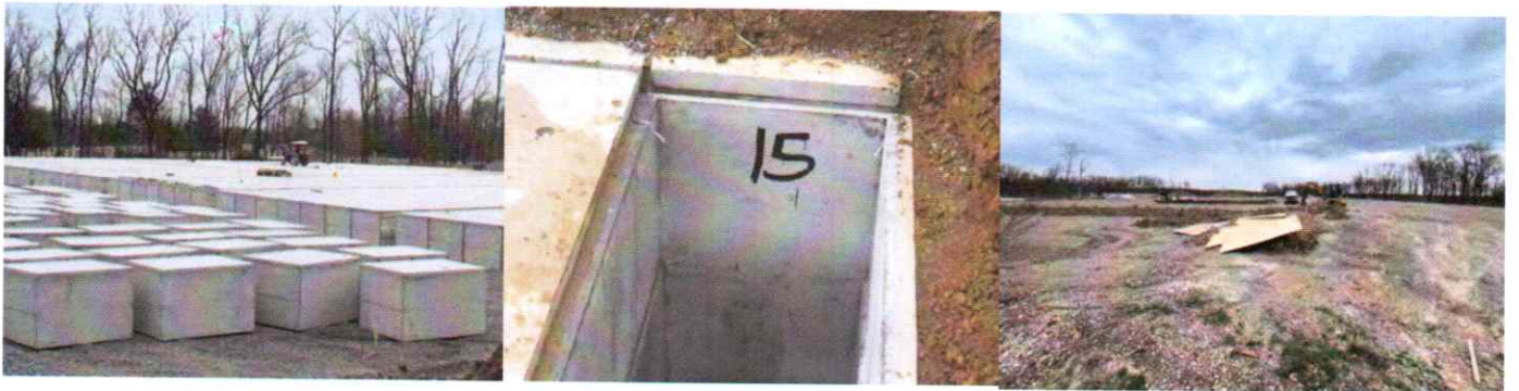
New Roads, a New Columbarium, a Reservoir with the start of a Pumping House for an Expanded Sprinkler System