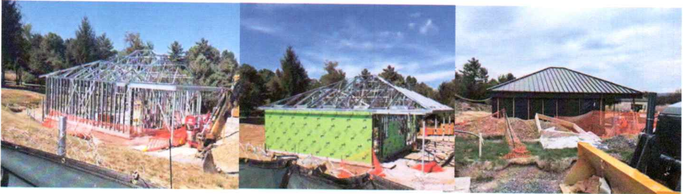
Road Work Around The Honor Guard Building Is Coming Along